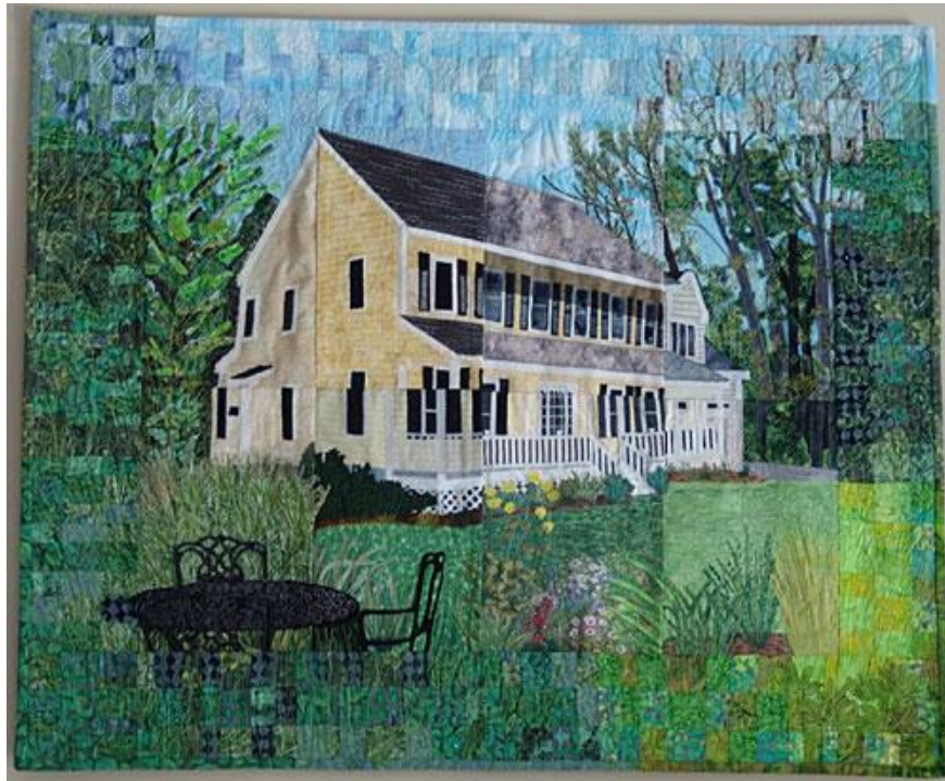
"Slice of Life" quilt