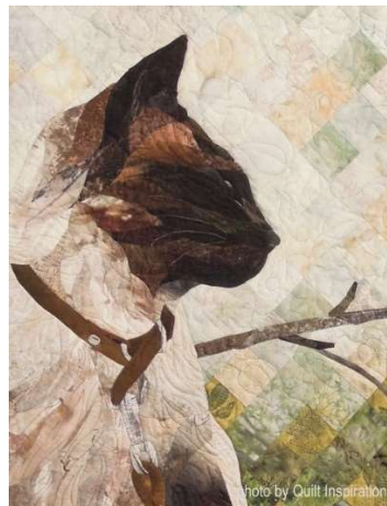
Close-up, Sami a.k.a. Tree Kitty