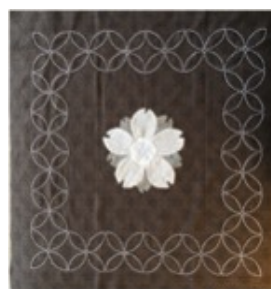
Appliquéd Center Sashiko Block

By day's end, participants will be well on their way to completing their very own work of art!